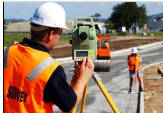
Tripod equipment used for site surveying.