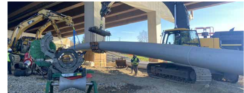
Feeding the pipe into the HDD hole by Enatai Beach Park.

6 Sweylocken We installed new pipe deep underground and began work for structures to tie that pipe into the Sweylocken Pump Station.