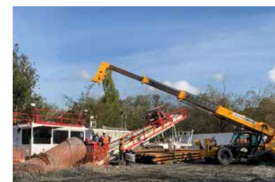
Crew members install a flange plate, which allows pipe segments to be easily screwed together.