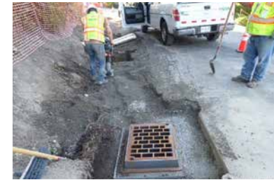
Crews install drainage improvements on 90th PI SE.