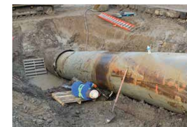
Preparing the site at Sweylocken for the HDD pipe pull.

6 Sweylocken We installed new pipe deep underground and began work for structures to tie that pipe into the Sweylocken Pump Station.