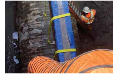
Air vents circulate fresh air for crew members working underground.

2 North Mercer Residential Streets We installed sewer pipes underneath residential streets including SE 22nd St, 78th Ave SE, and 90th PI SE. We began construction activities on SE 35th PI.