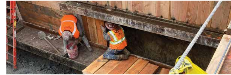
Crews build a retaining wall and install wooden panels, called lagging, to hold back the ground before building the temporary pump station.

1 North Mercer Pump Station We prepared the site and began building a temporary pump station.