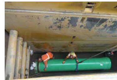
Shoring holds back the soil so that crews can safely work below the surface grade.

3 I-90 Trail We began installing sewer pipes across from Covenant Living at the Shores and continued pipe installation towards Shorewood Drive.