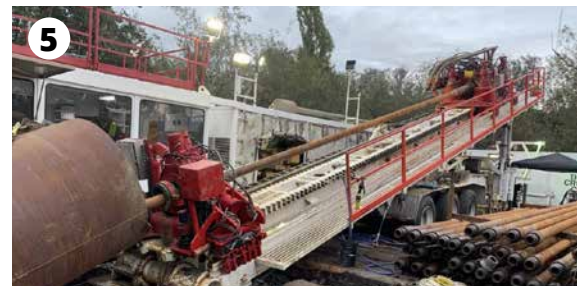
Photos: 1: 3,000 feet of fused pipe were floated on Lake Washington before the pipe was pulled under the Enatai hillside. 2: A crane lifted the new sewer pipe out of the water in preparation for underground installation. 3: Feeding the pipe into the HDD hole by Enatai Beach Park. 4: A rig at Sweyolocken pulls the end of the pipe line through the pipe path. 5: The new sewer pipe entered the pipe path at Enatai Beach Park.