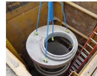
Crews install a maintenance hole where two pipes connect.

5 Enatai Beach Park We closed a portion of Enatai Beach Park underneath the I-90 bridge to use for material storage. We also began construction for structures to connect pipes from under Lake Washington to the pipe to Sweylocken.