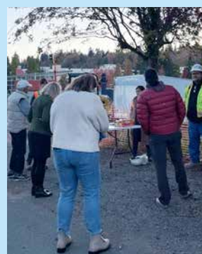
A group of neighbors meet with King County staff to discuss construction progress onto SE 78th St.

As work progressed onto new residential streets, we hosted four neighborhood walks to meet with neighbors, answer questions, and share updates about work.