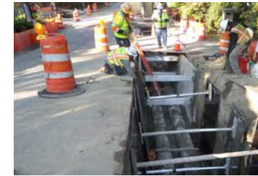
This year crews finished installing a new sewer main on SE 22nd St.

2 North Mercer Residential Streets We installed sewer pipes underneath residential streets including SE 22nd St, 78th Ave SE, and 90th PI SE. We began construction activities on SE 35th PI.