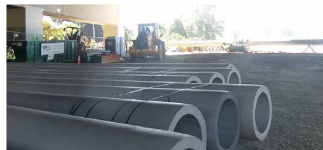
Staging areas near construction zones.

5 Enatai Beach Park We closed a portion of Enatai Beach Park underneath the I-90 bridge to use for material storage. We also began construction for structures to connect pipes from under Lake Washington to the pipe to Sweylocken.