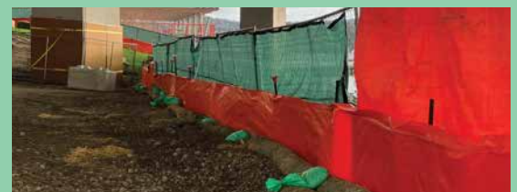
A silt fence protects waterways from debris at the construction staging area.

In water work is completed when spawning or migrating fish are less likely to be in the area, also known as a "fish window." This is a state and federal regulatory requirement that protects fish species in this region. In addition, we set up environmental protections such as silt fences to protect waterways and wildlife habitats.