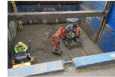
An odor control facility on SE 35th PI will neutralize odors where two pipes meet.