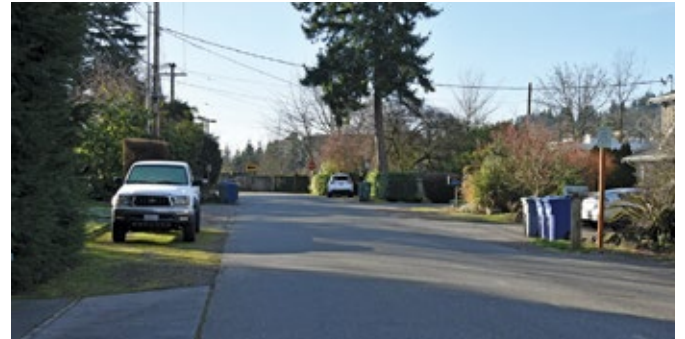
...on residential streets.