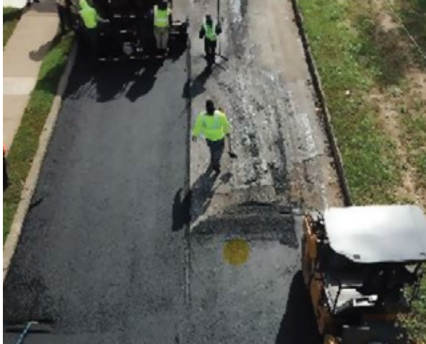
Streets will get new pavement

Construction will take a while, but once it's over we will restore and improve areas we impact.