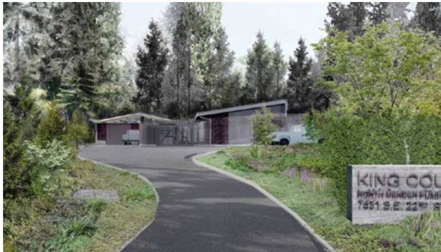
The North Mercer Pump Station will have new landscaping.

The I-90 Trail will be restored or resurfaced, consistent with Washington State Department of Transportation standards, and in alignment with Mercer Island's Aubrey Davis Park Master Plan.