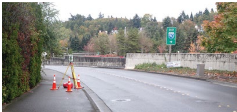
...on North Mercer Way.