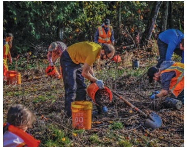
We will plant trees to replace the ones we remove and restore shorelines.