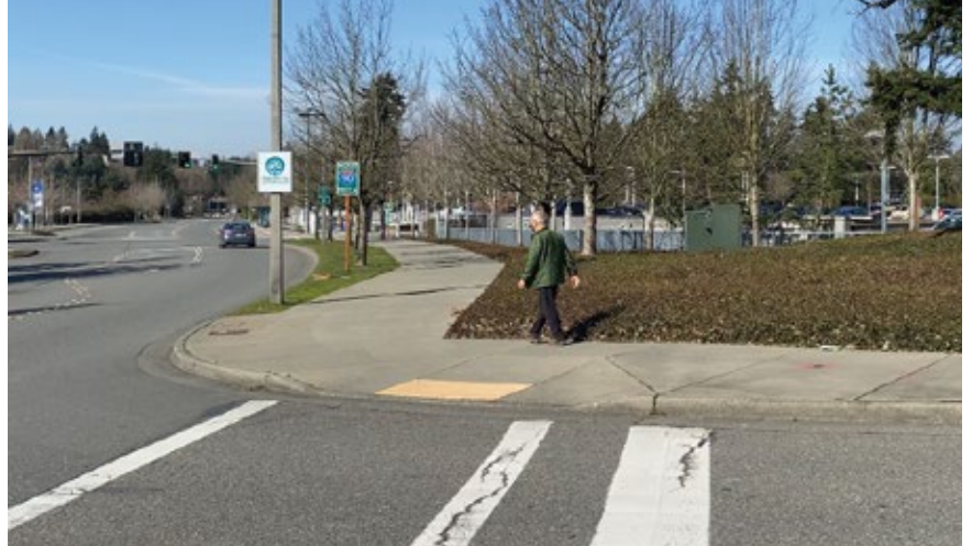
New crosswalks will be ADA compliant