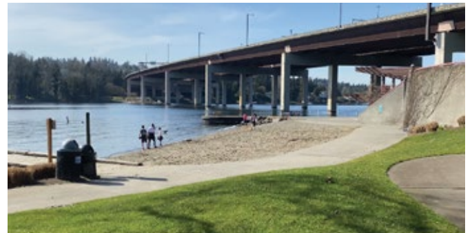
...in Enatai Beach Park.