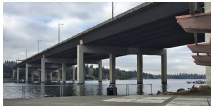
...underneath the East Channel.