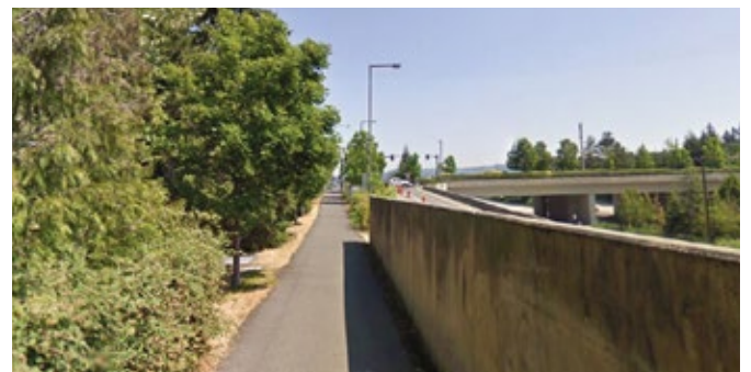
...along the I-90 Trail.