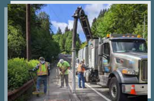
Crews locating utilities.