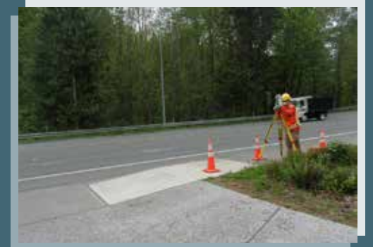
Crews surveying the future pipe alignment.

As our crews get ready for pipeline and pump station construction, you may see: