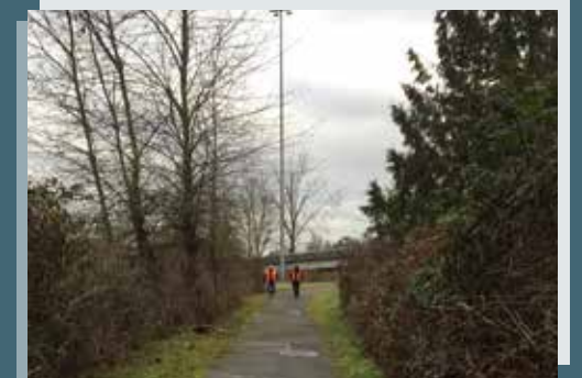
Crews walking the future pipeline route to get familiar with the project area.