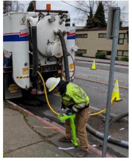
Typical equipment used for utility location

We will share additional information about impacts and schedule via the location-specific email lists, as needed. Learn how to sign up for targeted construction notifications on the reverse side of this PDF.