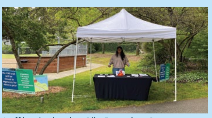
Staff hosting booth at Bike Everywhere Day.