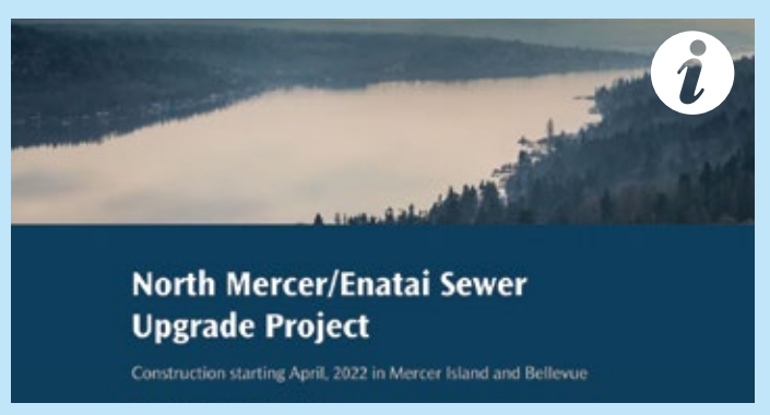
Find us online at kingcounty.gov/MercerEnataiSewer