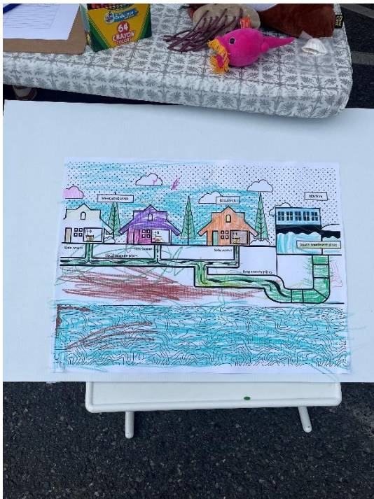
Coloring sheet colored in with booth visitors