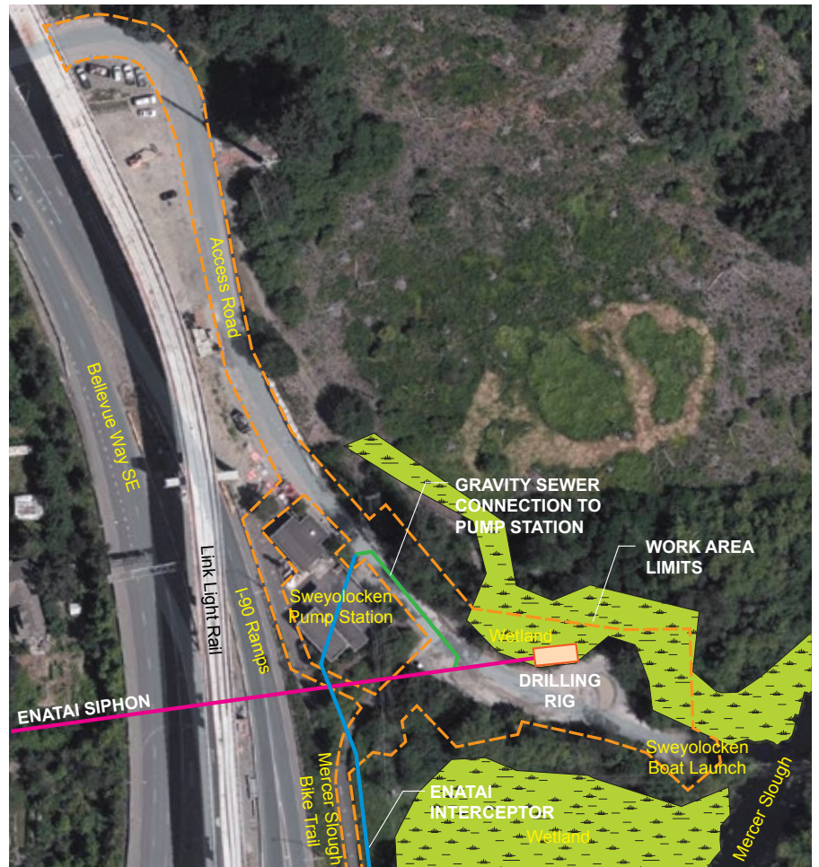
Sweyolocken Boat Launch and Pump Station Site During Construction of the Enatai Siphon Connection

Will the work affect wetlands and trees? Yes. About 20 trees will be removed, largely to make room for a staging area to store equipment and materials. The work area will extend into a wetland at one point. We will completely restore the affected wetland to its pre-construction condition once the work is finished.