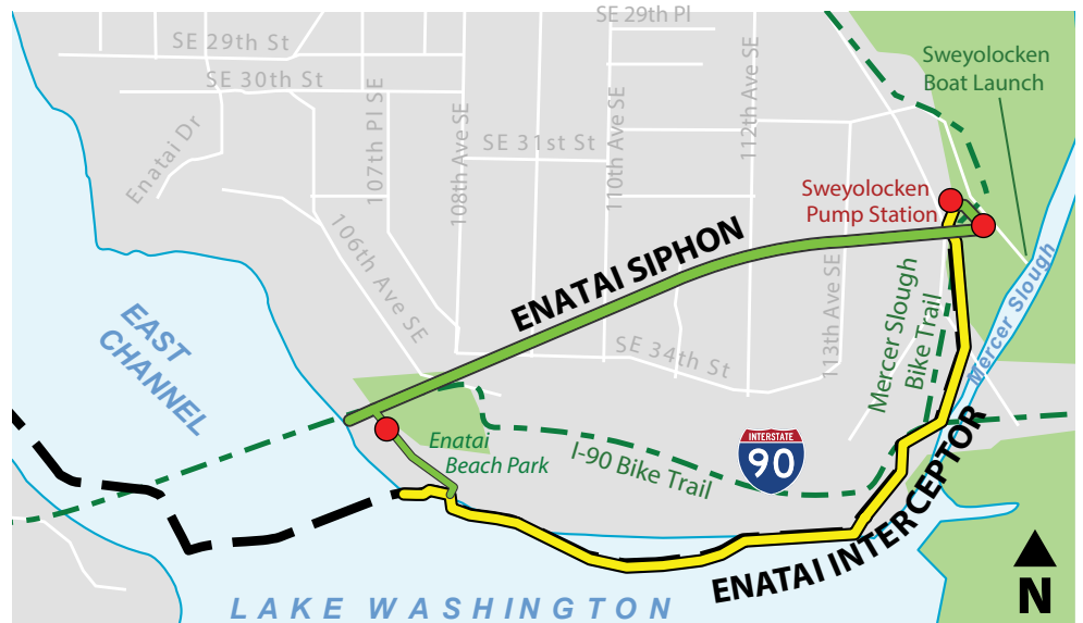
Installing the Enatai Siphon and upgrading the Enatai Interceptor will both have impacts in the area around the Mercer Slough and Swayolocken Boat Launch

The first part—installation of the Enatai Siphon by a construction process called horizontal directional drilling—will take place at the site of King County's Swayolocken Pump Station, along the access road to the boat launch. The Enatai Siphon will provide additional capacity for conveying wastewater for the North Mercer/Enatai system. Future wastewater flows that exceed the capacity of the existing Enatai Interceptor in Lake Washington will be diverted to this new siphon, which will be installed by drilling under the Enatai neighborhood. The siphon is essential to the project mission of ensuring that the system has enough capacity for wastewater flows expected through 2060.