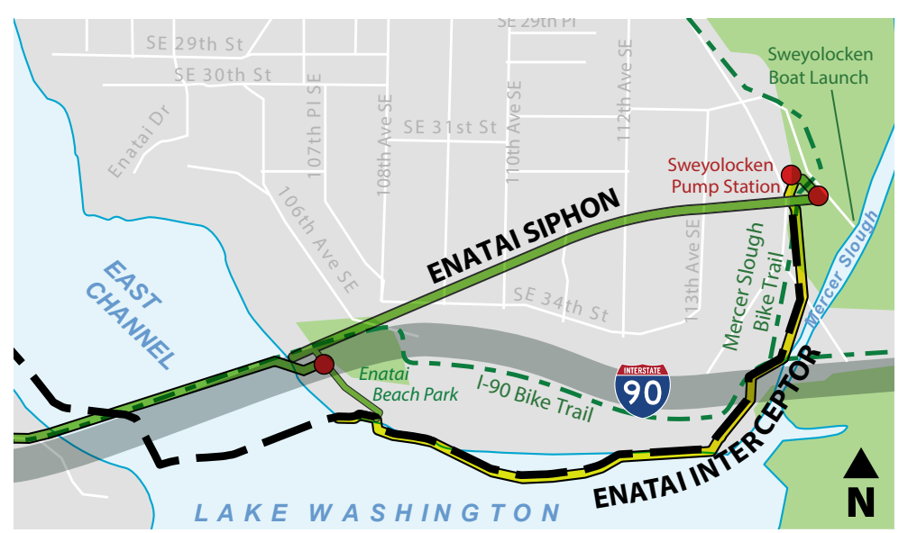
Installing the Enatai Siphon and upgrading the Enatai Interceptor will both have impacts in the area around the Mercer Slough and Sweyolocken Boat Launch

The first part—installation of the Enatai Siphon by a construction process called horizontal directional drilling-will take place at the site of King County's Sweyolocken Pump Station, along the access road to the boat launch. The Enatai Siphon will provide additional capacity for conveying wastewater for the North Mercer/Enatai system. Future wastewater flows that exceed the capacity of the existing Enatai Interceptor in Lake Washington will be diverted to this new siphon, which will be installed by drilling under the Enatai neighborhood. The siphon is essential to the project mission of ensuring that the system has enough capacity for wastewater flows expected through 2060.