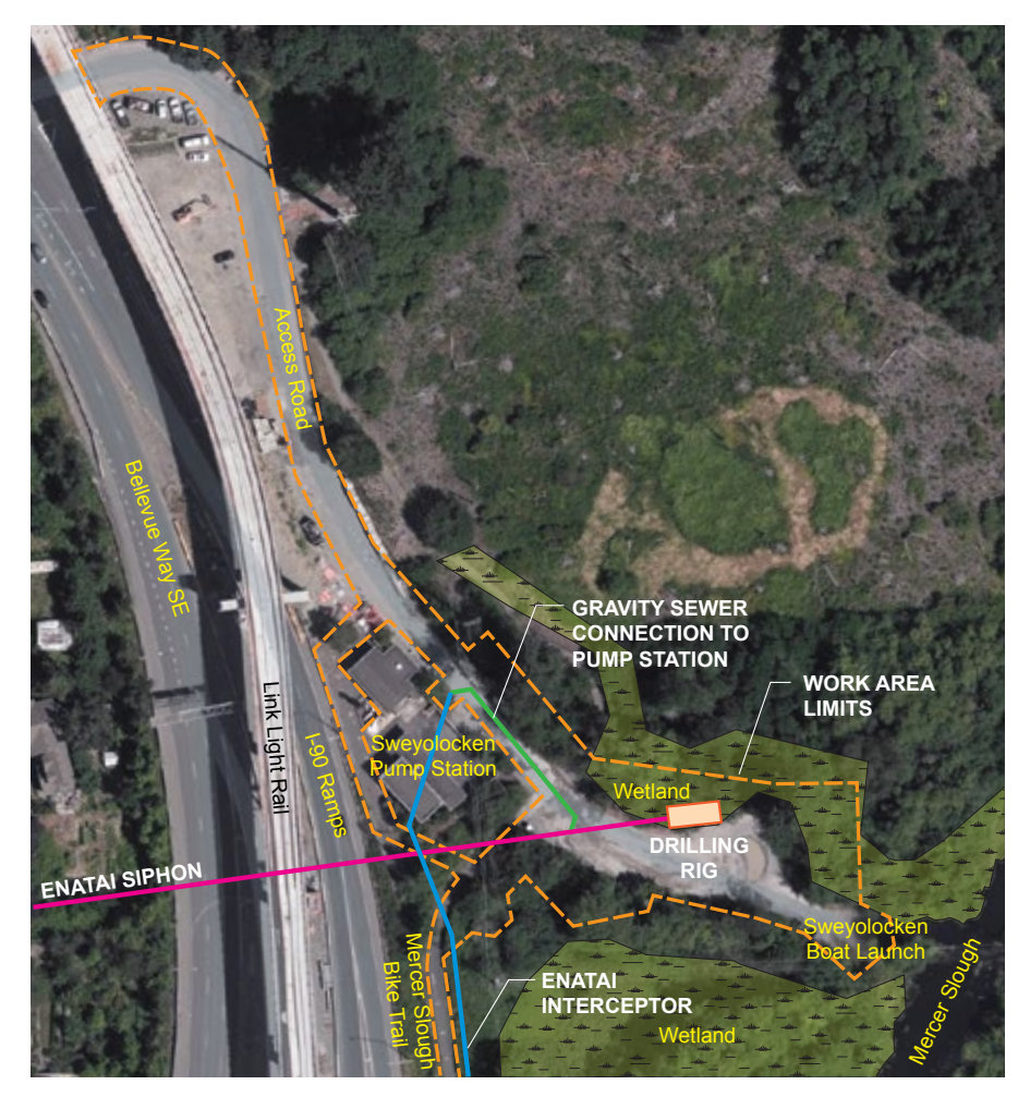
Sweyolocken Boat Launch and Pump Station Site During Construction of the Enatai Siphon Connection

in the area south of the pump station. During the siphon work, trail traffic will be detoured along side streets from near the South Bellevue Park & Ride to the I-90 Bike Trail near 108th Avenue SE. The I-90 Bike Trail will remain open throughout the majority of the work; however, detours may