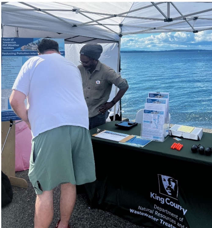
The project team shared information about the survey with community members at Alki Beach Pride.

Between July 1 and August 31, 2025 , we invited community members to take a survey. The survey gathered your ideas about how the new wet weather treatment station in SODO should look. We offered the survey in simplified and traditional Chinese, English, Khmer, Spanish, and Vietnamese. Thank you to everyone who participated and shared their feedback!