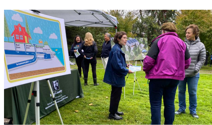
The Mouth of the Duwamish Wet Weather Facilities will address pollution from five King County outfalls at the mouth of the Duwamish River. Visit kingcounty.gov/MDWetWeatherFacilities to learn the latest updates about the project