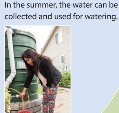
Cisterns come in several sizes and shapes to fit in a variety of situations.

A cistern is a large above-ground container used to collect roof water. It is like a huge rain barrel and can hold