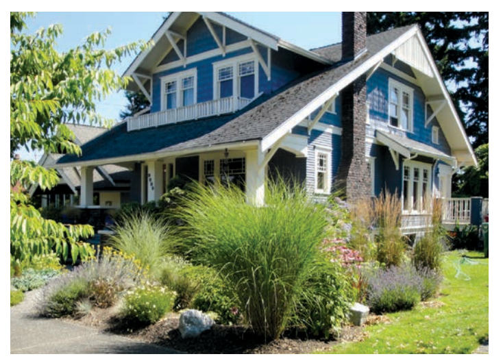
RainWise contractors design rain gardens that fit the unique needs of each site.