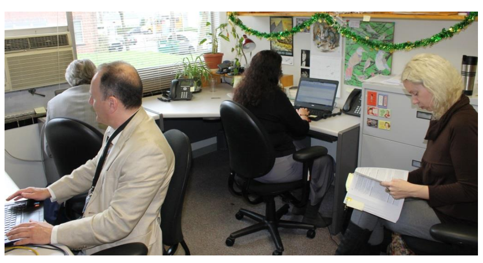
Three attorneys and a social worker from ACA's civil commitment unit share a crowded office some mornings.

forcing public defenders to travel to four – soon to be five – hospitals. This has raised a new and equally challenging set of issues. The hospitals have created video courtrooms, but confidential rooms – where attorneys can talk to their clients or family members – are at a premium. In some instances, the client is in a shared room, and attorneys either have to whisper to their client or ask