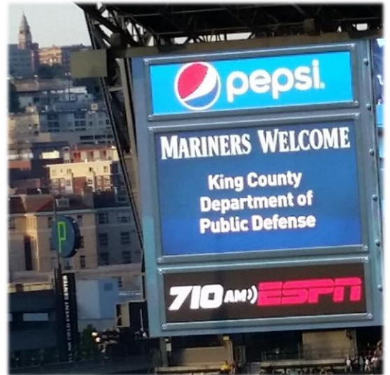
DPD staff also finds time to have fun together. In 2016, we went to a Mariners' game; we even got a welcome announcement on the scoreboard.