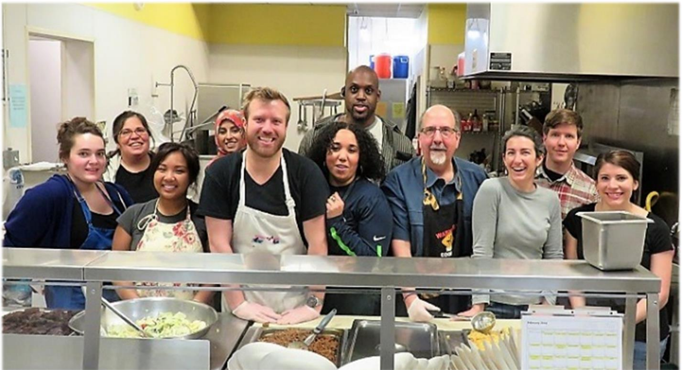
A group of DPD employees serve food for Operation Rescue.