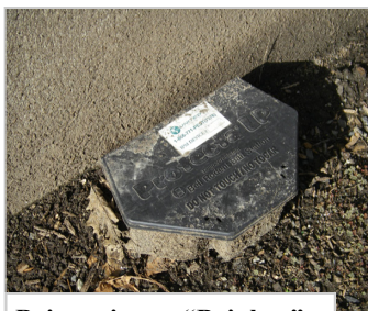
Bait station or "Bait box

Rat poison should always be used in secured bait station to keep it away from children and pets. Only use it according to the directions on the label.