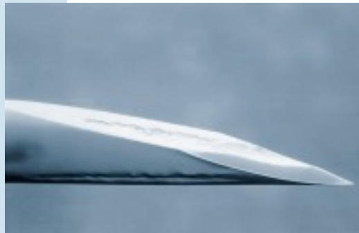
New needle point

Use a brand new syringe EVERY TIME you poke your skin or vein.