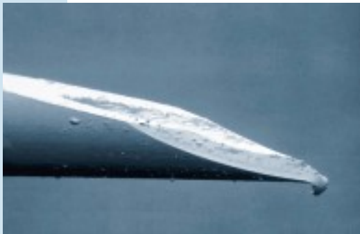
Needle point, used twice