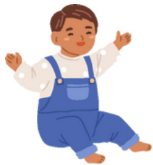
Niñniñ im ajiri ro redik

Āinwot uno ko, emaroñ wor men eo ej walok elikin am bōk, wā. Men eo ekkā tata an walok edik im ej māke jako. Lale jaat in ilal ñan lale wā eo ekar ñan eok.