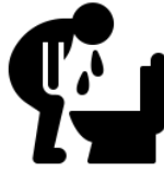
Vomiting after cough