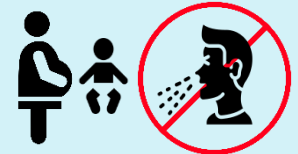
Avoid being near babies and pregnant people