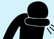
Kalbubu pokok kin jimwin beim ak peba tissue