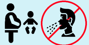
Jab bed iturin niñniñ im kūrae ro