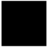
Actual size hole a rat can enter

Rats squeeze into tiny spaces, nest where it is dark and warm and can produce a litter of pups (babies) every 3 to 4 weeks!