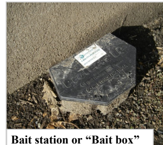
Bait station or "Bait box"

Rat poison should always be used in secured bait station to keep it away from children and pets. Only use it according to the directions on the label.