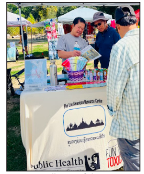
Lao Team talking to fisher at Sawasdee Thai Festival.