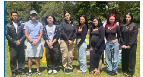
Youth conducting their first outreach event at Seward Park.