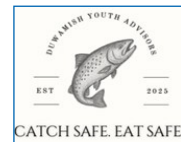
DYA team designed their new logo!

"We got to see a rare crab that we caught and even some starfish. I think the crabbing day also helped some of the youth connect. I was able to talk to one of the youth more, and it was fun to hang out with her. I really enjoyed the crabbing day and I hope to go again." - DYA member