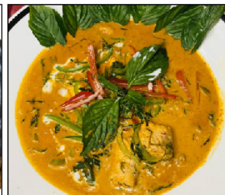
Salmon Panang Curry recipe by Lao Team

Scan the QR code to see all the recipes!