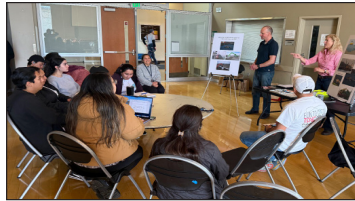
CHAs receiving updates on the latest Duwamish River cleanup construction efforts from Lower Duwamish Waterway Group.

"The team loves doing outreach at fishing piers because we talked directly to the fishing community while enjoying fishing, crabbing, squidding activities. We love seeing fishers connected with us sharing jigs, offering us umbrellas, fish being caught and shared with us. This shows we are being trusted by fishers!" - Vietnamese CHA