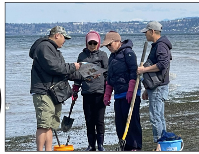
Vietnamese Team talking to fishers at Dash Point State Park.