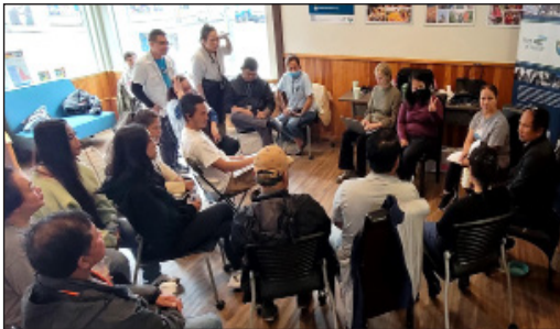
CHAs making decisions on strategy implementation in their Mom & Caregivers and Fishers Workgroups during June CSC.

"We got to see a rare crab that we caught and even some starfish. I think the crabbing day also helped some of the youth connect. I was able to talk to one of the youth more, and it was fun to hang out with her. I really enjoyed the crabbing day and I hope to go again." - DYA member