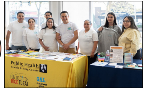
GAL Team conducting outreach at the Burien library.