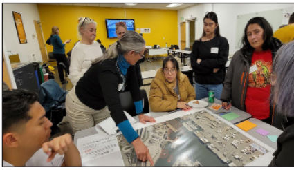
GAL CHAs providing input at EPA Roundtable meeting.

"I like joining in clamming/ fishing activity the program has because I get to know people in the community and have fun enjoying clam harvesting and fishing at many locations."