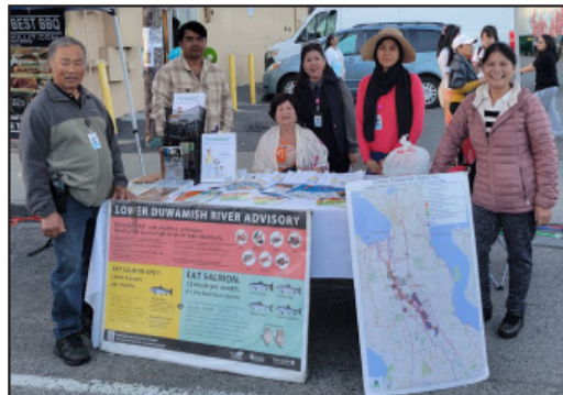
Khmer team tabling at night market event in White center.

activities conducted (including one-on-one, small group, tabling events, etc).