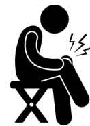
Joint or muscle aches