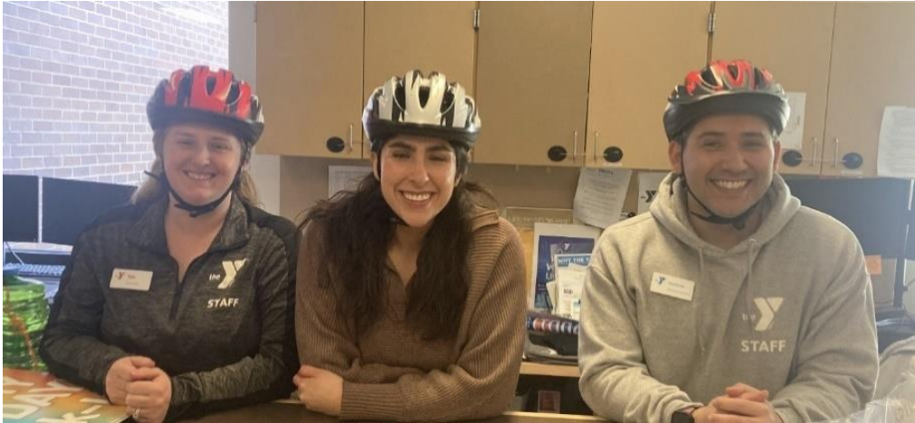
The West Seattle YMCA staff smile after receiving helmet-fit training from VIP staff. They fitted 100 young people with free helmets during the YMCA’s annual Healthy Kids Day in May.

VIP staff distributed 2512 free bicycle helmets to King County residents, prioritizing low-income residents, communities of color, and unhoused communities. Appropriate staff received helmet fit training when the helmets were given to organizations.