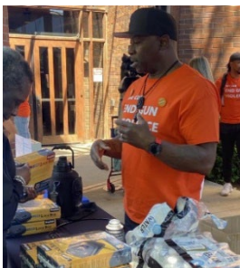
Partners from Community Passageways distributing our devices at a Gun Violence Awareness Day event in Kent

Lock It Up excels at reducing barriers by providing free high-quality safety devices, often unaffordable or inaccessible in many communities.