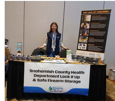
Partners from the Snohomish County Health Department distributing our devices at the Tulalip Environmental Resource Fair