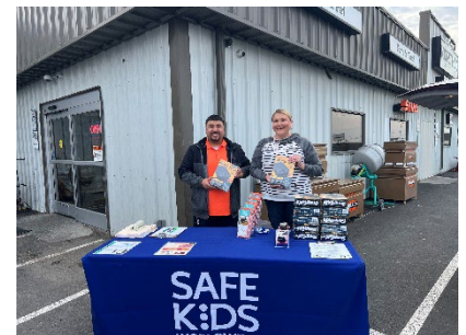
Partners from the Grant County Health District holding a multilingual distribution in Moses Lake