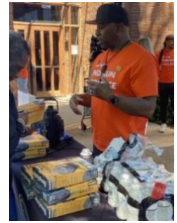
Partners from Community Passageways distributing our devices at a Gun Violence Awareness Day event in Kent