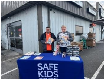
Partners from the Grant County Health District holding a multilingual distribution in Moses Lake