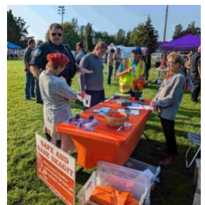
Partners from Safe and Sane Skagit distributing our devices with the Police Department

PHSKC’s Lock It Up program shows how local health jurisdictions can effectively partner with diverse communities statewide. In its first year, the program built trust, distributed 6,581 safety devices, and encouraged open conversations about firearm safety. With continued funding, we aim to deepen partnerships with marginalized communities, including youth programs and tribal agencies, and expand outreach to Southeast and Southwest Washington and additional youth-serving organizations to save lives and strengthen community safety.