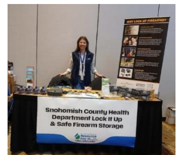
Partners from the Snohomish County Health Department distributing our devices at the Tulalip Environmental Resource Fair