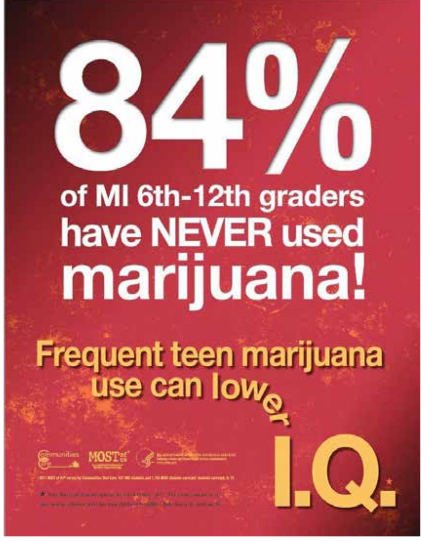
Poster showing that most 6th-12th grade students on Mercer Island in King County, Washington have never used marijuana.

**All other illegal drug use includes prescription drugs not prescribed, prescription painkillers to get high, and all other illegal drugs; but does not include alcohol, tobacco or marijuana. Source: http://www.askhys.net/FactSheets