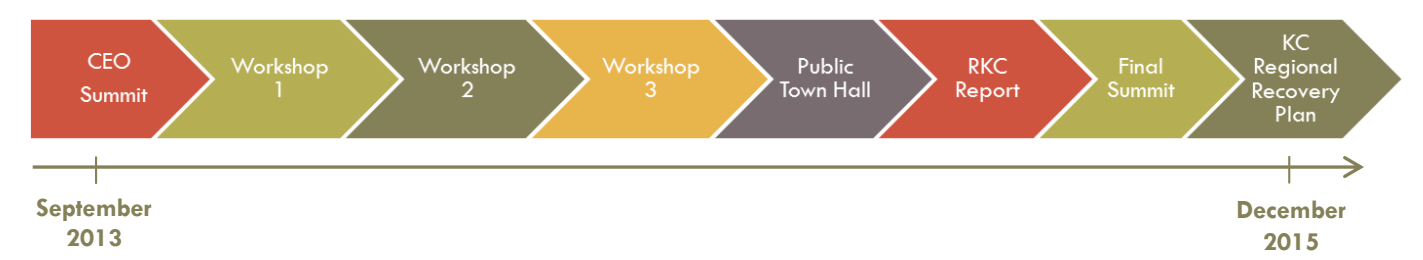
Figure 6. Timeline of the Resilient King County initiative (September 2013 – December 2015).