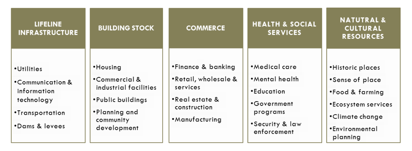
Figure 5. Resilient King County critical sectors and corresponding subsectors.

There are five Resilient King County critical sectors: lifeline infrastructure, building stock, commerce, health & social services, and natural & cultural resources (see Figure 5). Full recovery must be achieved for each sector after a catastrophe to achieve overall recovery for King County. The critical sectors were developed based on reference to FEMA's National Disaster Recovery Framework (NDRF) Recovery Support Functions (RSF's) and Resilient Washington State sectors.