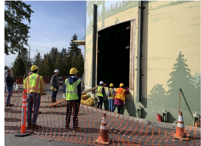
2019: American Water Works Association Young Professionals take a tour of the 2 MG tank seismic retrofits. The contractors conducted all work through a large access point cut into the wall of the steel tank.