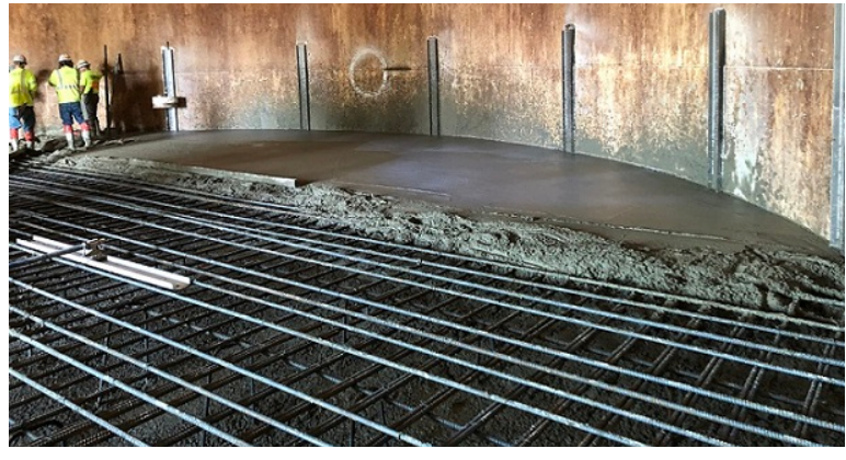
2019: Seismic retrofits at the District's 2 million gallon tank included the pouring of a concrete pad and installing steel stiffeners on the inside walls.

Using guidance materials provided by King County, Sammanish Plateau Water met with an