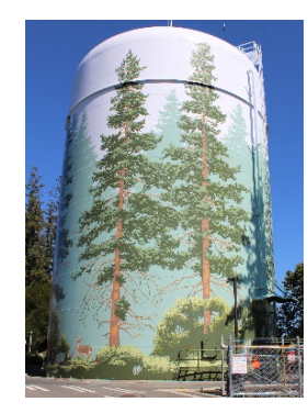
Sammamish Plateau Water built its second water tank at its headquarters site in 1956. The District replaced this tank with the 2 million gallon tank in 1977. The District upgraded the tank with retrofits to enhance tank stability during seismic events in 2019.