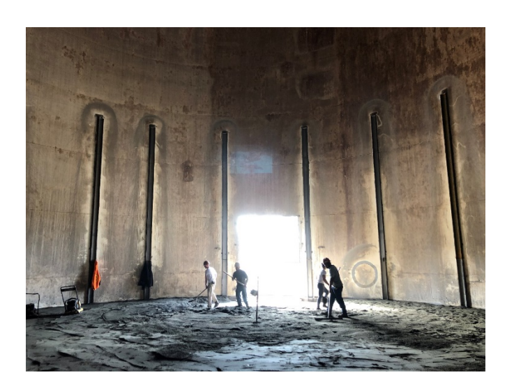
2019: The District installed steel stiffeners inside the 2 MG tank to provide stability during seismic events. Note the size of the workers for scale.