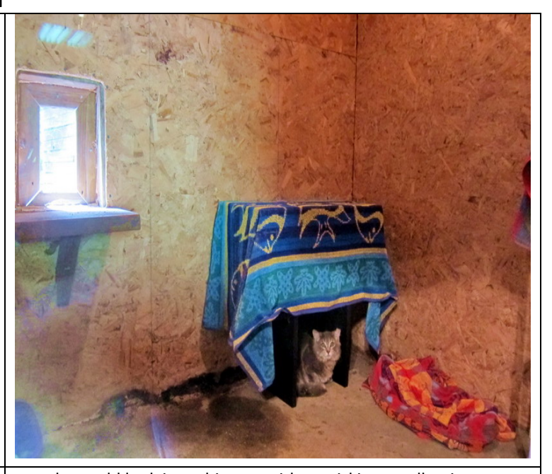
... so he could look in on his cats without risking an allergic reaction. He installed a second window on the other side so the cats can see outside, along with a cat door (not shown). Sweet!