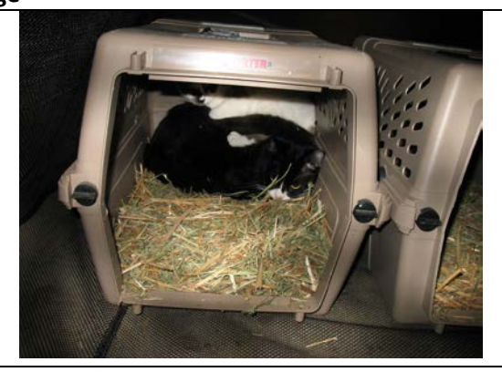
The cats each had their own straw-bedded crate, but they bonded instantly release in the tent.