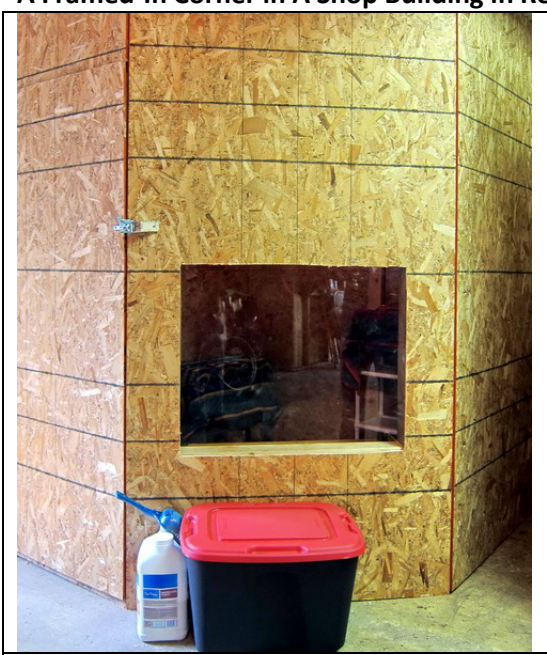
The owner has allergies, but still wanted to see his cats, so he framed in a corner of his workshop, and equipped it with a Plexiglas viewing window one side...