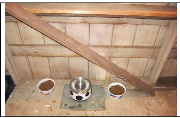
The landowner cleared out some space in a tool shed, and set up food and water bowls on one side...