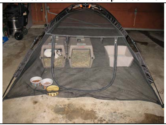
The mesh pop-up tent is available from Amazon.com for about $50.00. You can also use a regular camping tent.