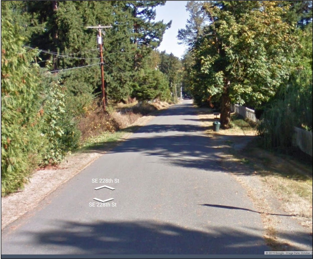
b. Looking east onto SE 228 th Street from Witte Rd.