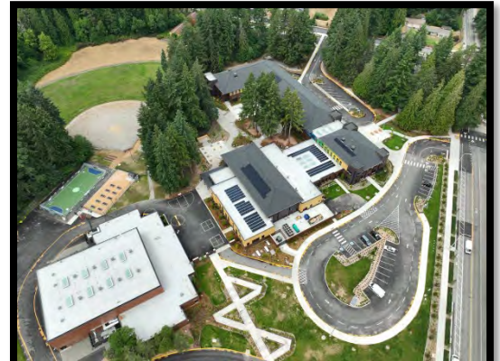
Illahee Middle School