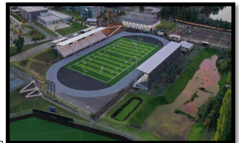
Memorial Field Renovation