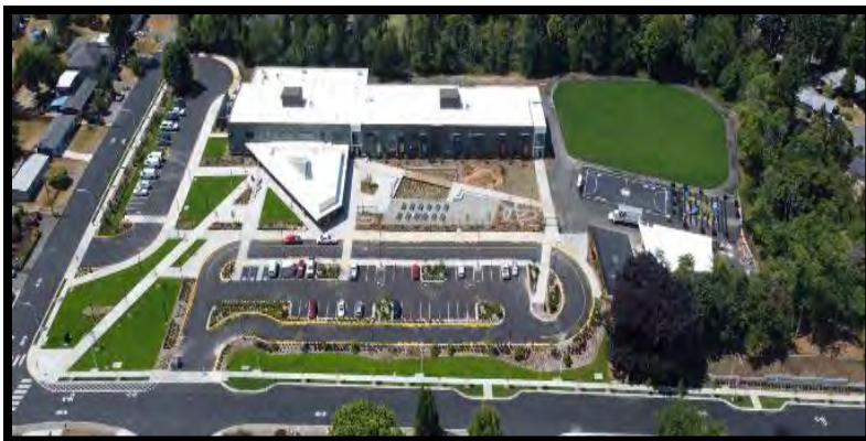
Olympic View K-8