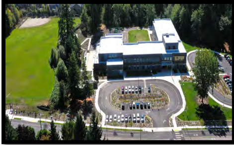
Lake Grove Elementary