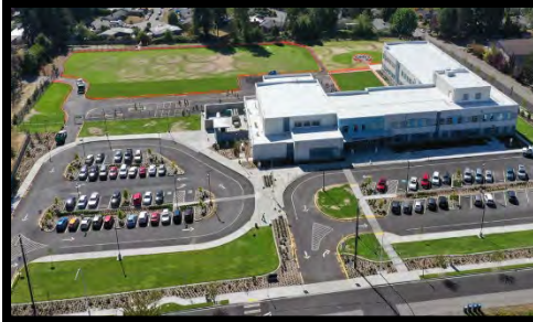
Mirror Lake Elementary