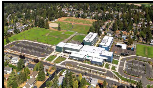
Star Lake Elementary/ Evergreen Middle School