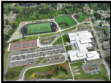
Thomas Jefferson High School