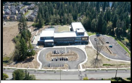
Lake Grove Elementary

Each Scholar: A voice. A dream. A BRIGHT future.