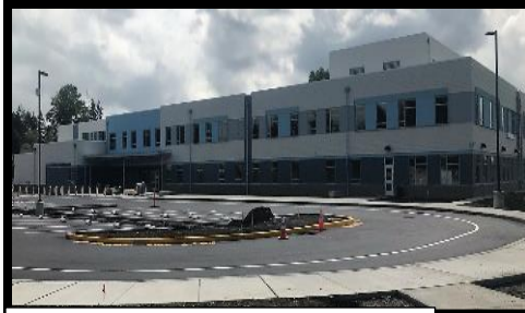
Mirror Lake Elementary