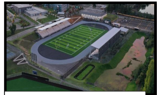
Memorial Field Renovation