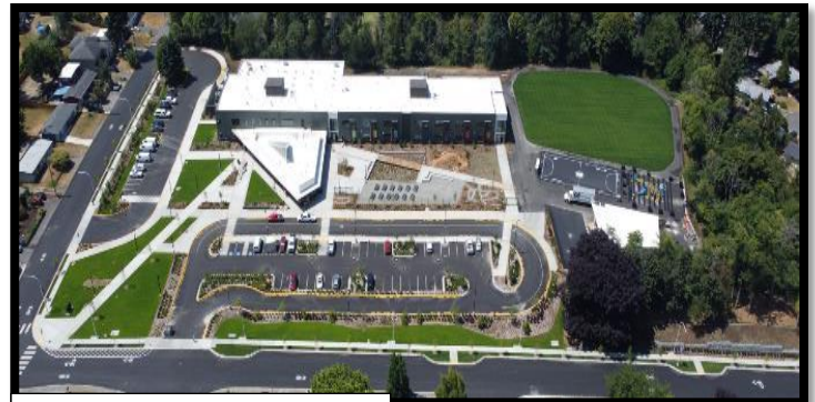
Olympic View K-8