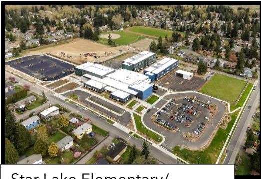
Star Lake Elementary/ Evergreen Middle School