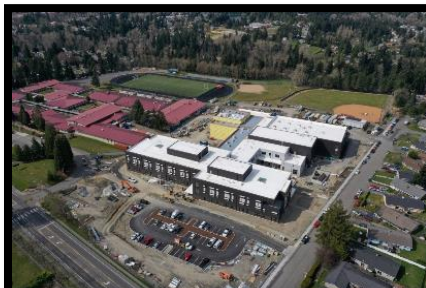
Thomas Jefferson High