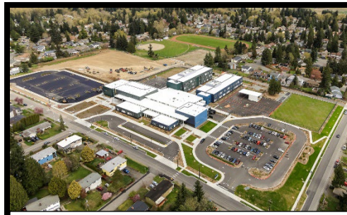
Star Lake Elementary/ Evergreen Middle School