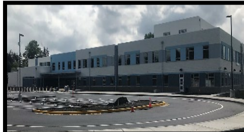
Mirror Lake Elementary