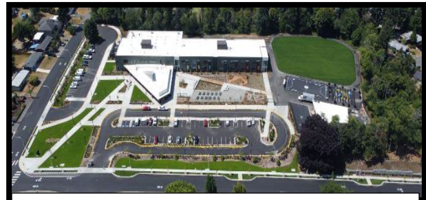
Olympic View K-8 School