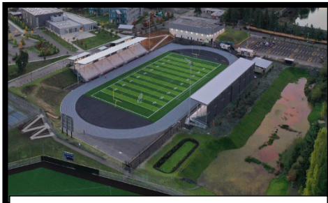
Memorial Field Renovation