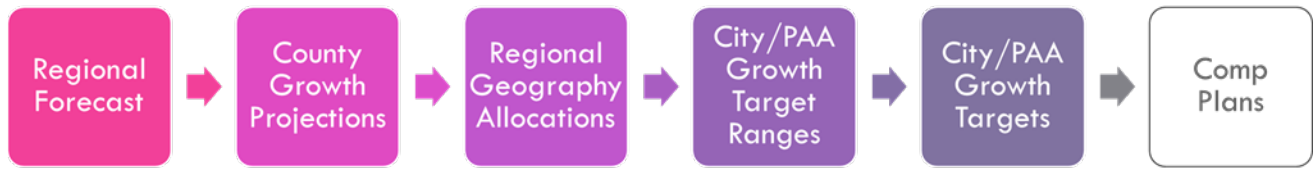
Figure 1: Growth targets setting process

Developing the growth targets has 5 key stages, before implementation in comprehensive plans, as illustrated in figure 1. The following discussion summarizes the targets development process.