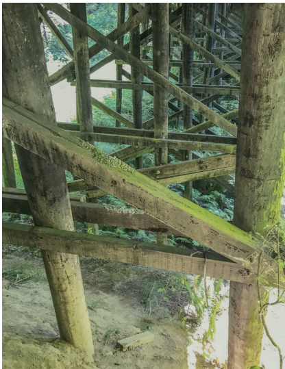
Creosote-treated timber piles are decaying.