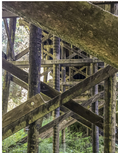
Bridge timber structure is over 100 years old.

TITLE VI: It is King County's policy to assure that no person shall, on the grounds of race, color, or national origin, as provided by Title VI of the Civil Rights Act of 1964, be excluded from participation in, be denied the benefits of, or be otherwise discriminated against under any of its federally funded programs and activities. Any person who believes their Title VI protection has been violated may file a complaint with King County, please contact Lydia Reynolds-Jones at 206-477-8100.