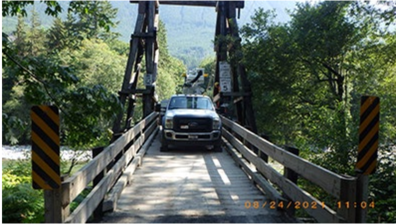
August 24, 2021: Bridge inspectors at work on Baring Bridge.

August 24, 2021 – Road Services inspected the entire bridge, including the support structures, bridge deck and underside. Baring Bridge is fully inspected every year.