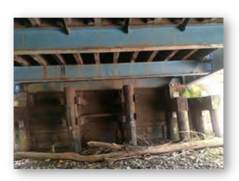
The 63-year-old creosote timbers are rotting.