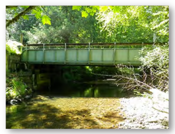
This bridge carries residents to the local community and many visitors to Lake Walker Recreational Area.

The new bridge structure will be open to all vehicles, carry no weight restrictions, and is expected to last for decades.