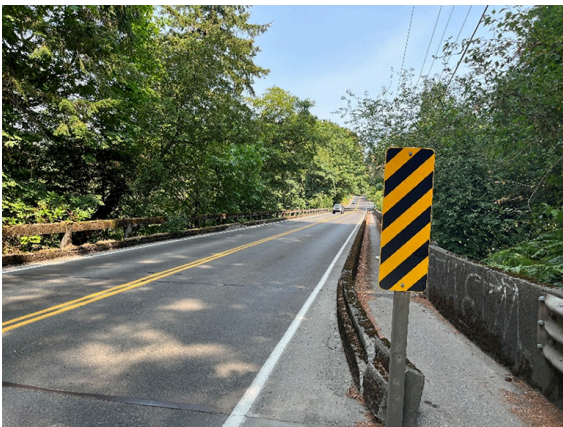
Judd Creek Bridge is located on Vashon Highway SW between SW Quartermaster Drive and SW 228th Street.

The work requires a six-week-long road closure on Vashon Highway SW between SW 225th Street and SW 227th Street. The road must be closed because the bridge is too narrow to keep a lane open and maintain a safe work area for the crew.