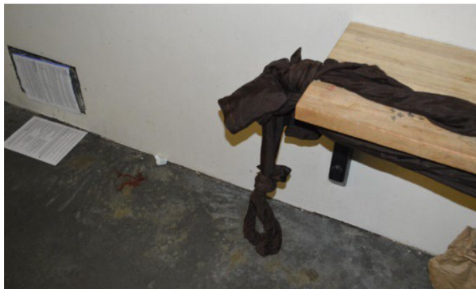
Caption: Photo of the death scene. Depicted are the ligature and the table the ligature was wrapped around.

At approximately 3:02 A.M., the Seattle Fire Department (SFD) was called to the scene. Upon arrival, SFD personnel took over life-saving efforts. SFD continued CPR and IV drug intervention but after no change in subject Jennings' condition, SFD ceased life-saving efforts and at approximately 3:28 A.M., subject Jennings was pronounced deceased.