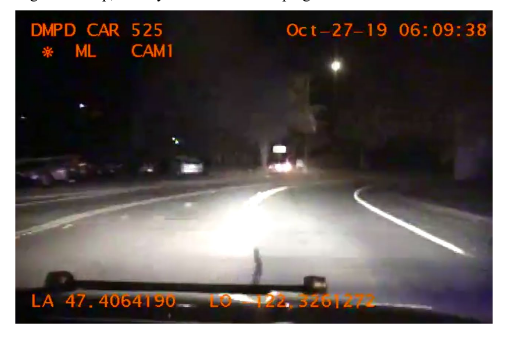
Figure 1 - Screenshot of Witness Officer 1's ICV showing the Nissan leaving the roadway.

At approximately 6:08 am, Witness Officer 1 saw that the vehicle failed to properly negotiate a curve, continued straight, drove over the curb, and came to rest several feet from the road at the edge of a steep, heavily wooded down-sloping embankment.