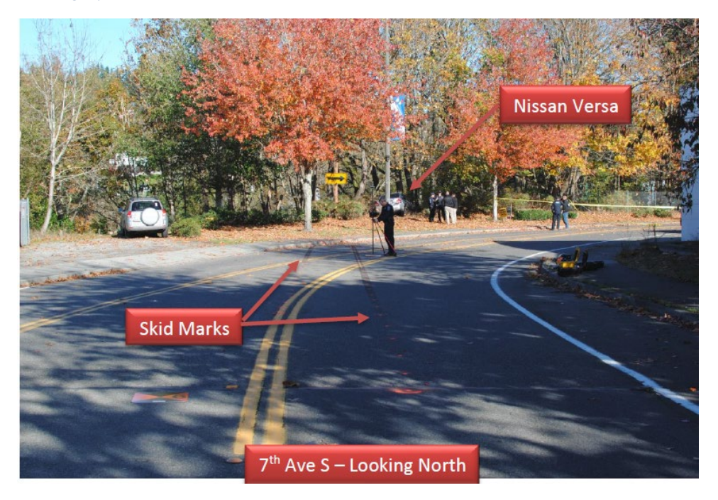
Figure 8 - Image depicting tire skid marks and the Nissan's final resting place.

Approximately three weeks after the incident, investigators measured the water level of the creek. At 4:46 pm on November 8, 2019, the center of the creek measured approximately