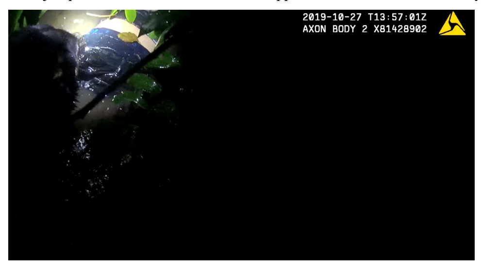
Figure 6 - Screenshot from Witness Officer 3's BWV showing the location Acosta was found.

The K9 searched the area and brought the officers into the creek, which Witness Officer 3 estimated was two feet deep. After approximately thirty minutes of searching, Witness Officer 3 observed the K9 jump into the water and saw the K9 appeared to contact a human body.