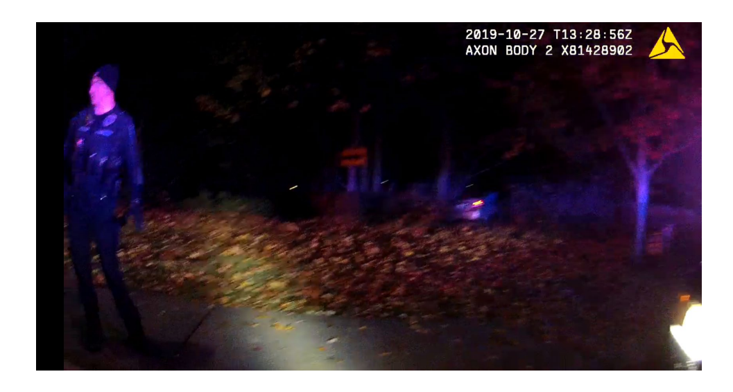
Figure 3 - Screenshot of Witness Officer 3's BWV showing the lighting conditions at 13:28 Zulu Time Zone, which is 6:28 am PDT.