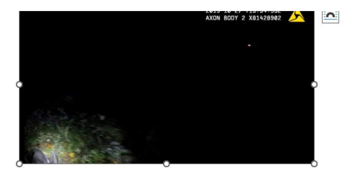
Figure 4 - Screenshot of Witness Officer 3's BWV showing the lighting conditions. His K9 (lower left) is visible only with the assistance of a flashlight.