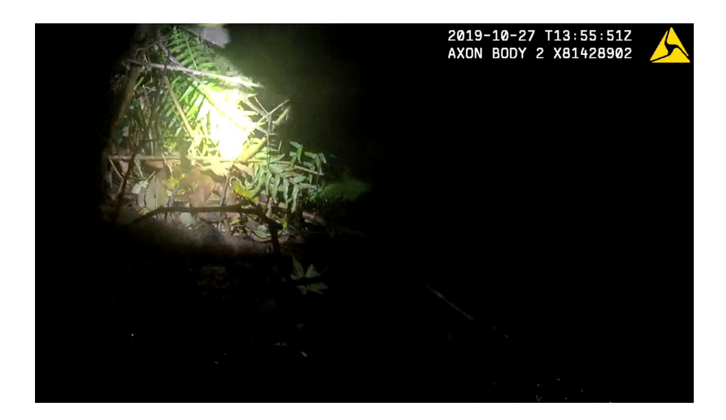
Figure 5 - Screenshot of Witness Officer 3's BWV showing the brush blocking access to the creek where Acosta was found.

The K9 searched the area and brought the officers into the creek, which Witness Officer 3 estimated was two feet deep. After approximately thirty minutes of searching, Witness Officer 3 observed the K9 jump into the water and saw the K9 appeared to contact a human body.