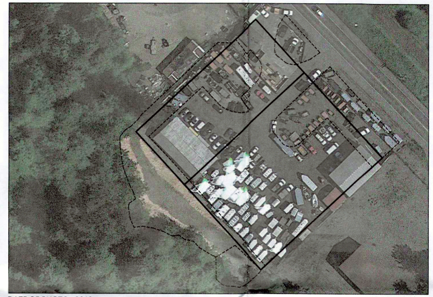
DATE OF PHOTO: 2018 PHOTO REFERENCE: GOOGLE EARTH