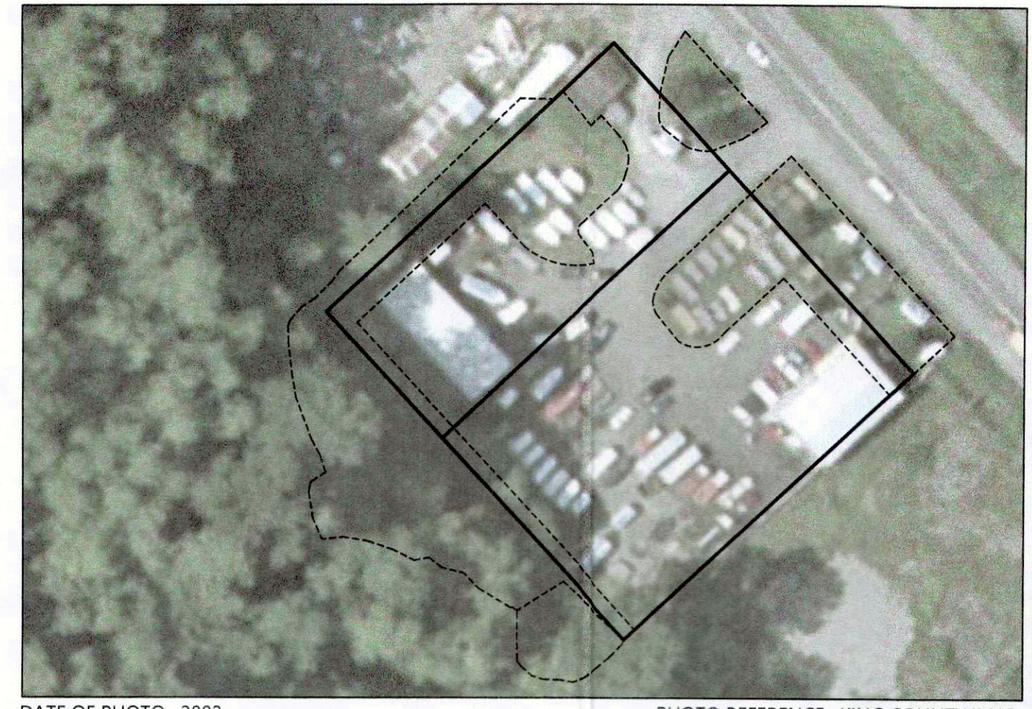
DATE OF PHOTO: 2002