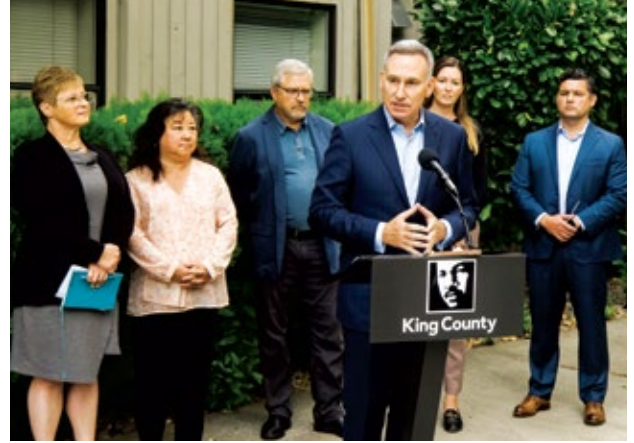
Hoolka shirarka saxaafada ee Cascade

Baahida daawaynta dadka deegaanku si wayn ayay uga badan tahay waxa hadda la heli karo. Intii u dhaxaysay 2016 ilaa 2020, bixiyaasha Degmada King waxay aqoonsadeen wax kabadan 6,000 dad kuwaasoo si fiican loogu adeegi lahaa adeegyada dadka deegaanka, marka loo eego qalabka kala saarista iyo sidoo kale muujiyaasha baahida sida hoy la'aanta, ballansashada jeelka, booqashooyinka qolalka deg-dega ah, xisaabinta barnaamijyada dabmiyada, iyo daawaynta mutadawacnimada ah ee dhakhtarka. Kaliya 315 dad cusub ah ayaa loo ogoaaday daawaynta dadka deegaanka intii lagu gudo jiray muddadaa shanta sanno ah.